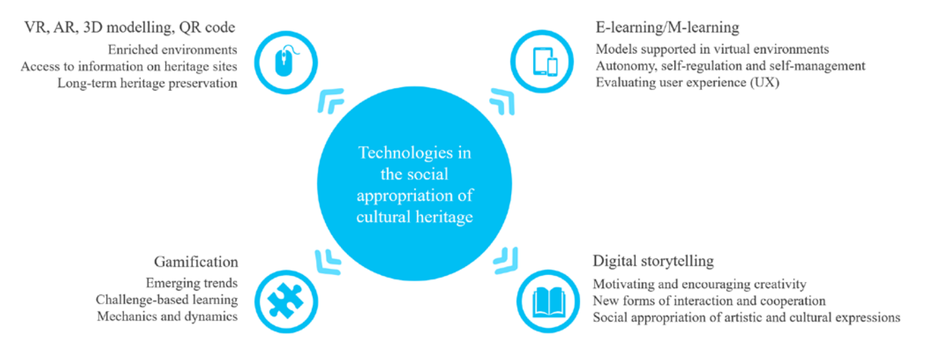
Figure 1: The teaching of cultural heritage with ICT tools.

In this regard, a previous study has pointed out that the integration of technological resources in heritage teaching enables the creation of innovative scenarios for motivation and exchange of experiences, where students can establish links with cultural heritage [13]. Thus, in the field of heritage teaching, trends stand out that point to the integration of virtual reality, augmented reality, digital narratives, gamification, video games and m-learning, as shown in Figure 1 [2].