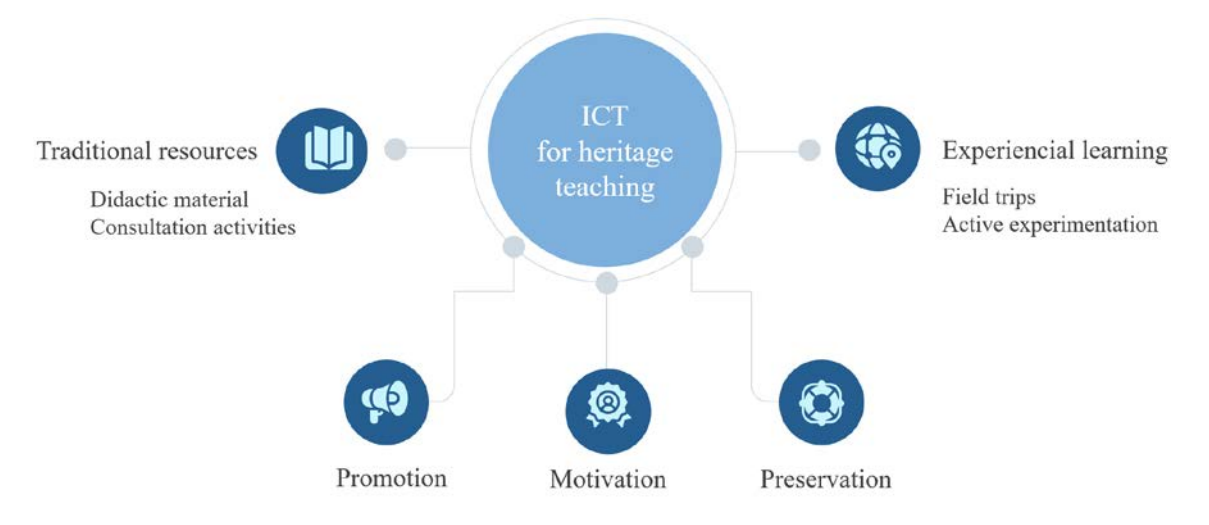
Figure 4: Emerging categories from the opinion of teachers in relation to heritage teaching using ICTs.

The analysis of items 16, 18, 22 and 24 allowed to identify the use of technological resources by social science teachers and the way in which they are included in the processes of teaching cultural heritage. Accordingly, five emerging categories derived from the teachers' opinions are evident (Figure 4).